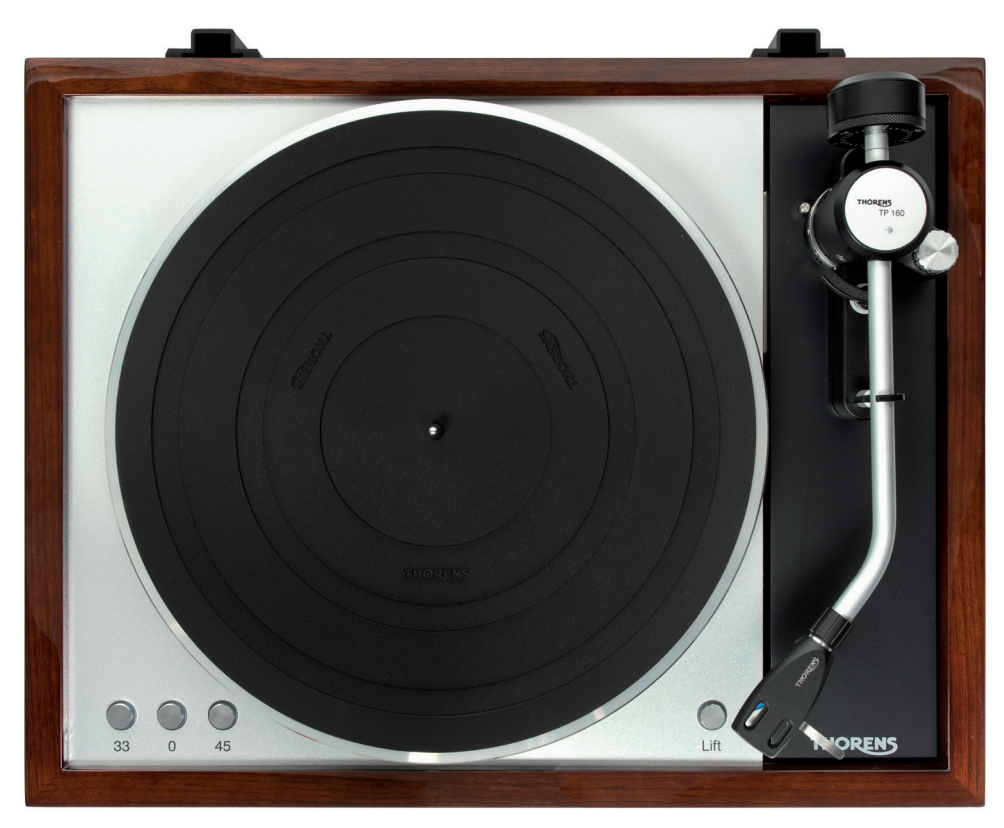
TD 1601 with TP 160 tonarm