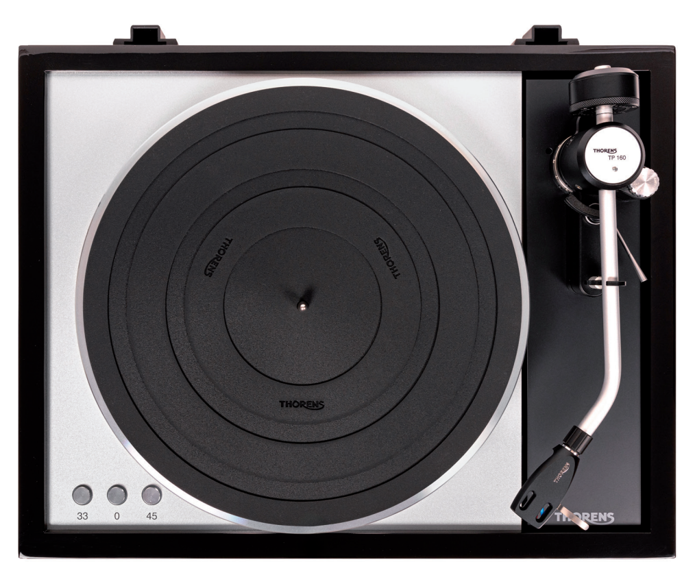
TD 1600 with TP 160 tonarm